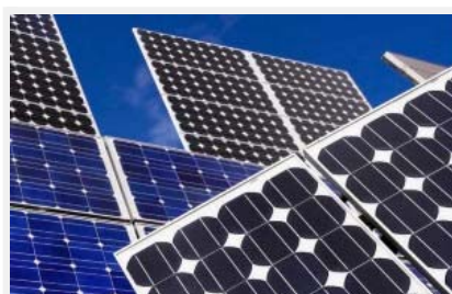
China vows retaliation of European Commission agrees to tariffs on solar panels.

And now the E.U. trade dispute over solar has China up in arms. This is a strategic sector in China. The country's leaders do not want to see it implode. As it is, the bulk of their exports all go to Europe. The U.S. slapped tariffs on solar panels last year. Exports are on the decline now that some European