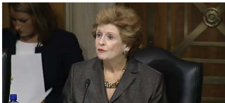
Senate Agriculture Committee Chairwoman Debbie Stabenow voices concerns about Shuanghui International's proposed buyout of Smithfield Foods

A Chinese takeover of Virginia-based Smithfield Foods is a precedent-setting sale with massive market implications, a Senate committee was told Wednesday.