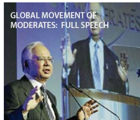
GLOBAL MOVEMENT OF MODERATES: FULL SPEECH

2013 Ford Explorer Strong, Capable, Spacious & Smart!