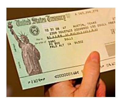
You're In For a Big Surprise If You Own A Home